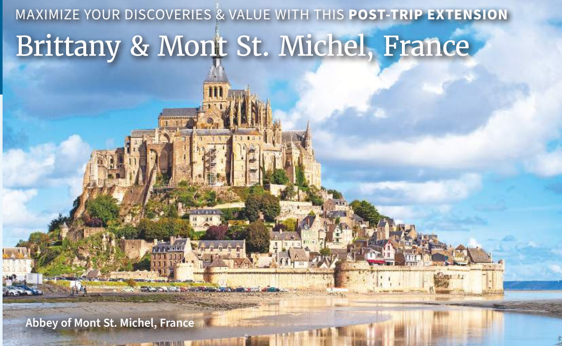
Abbey of Mont St. Michel, France